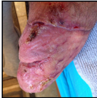
Before, when wearing a silicone liner