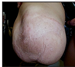
Three weeks post initial fitting with Alps Easyliner.

Case history provided by: Jim McElhiney, CPO, Nashville (USA).