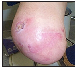
One week post initial fitting with Alps Easyliner.