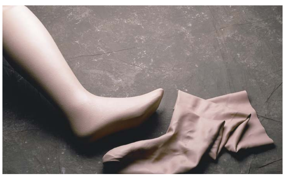
US Patent 6,911,049